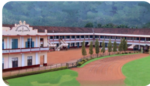
St Philomena's College