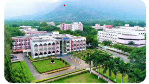
Karunya Institute of Technology & Sciences