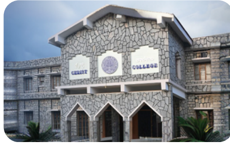
Christ College Mysore