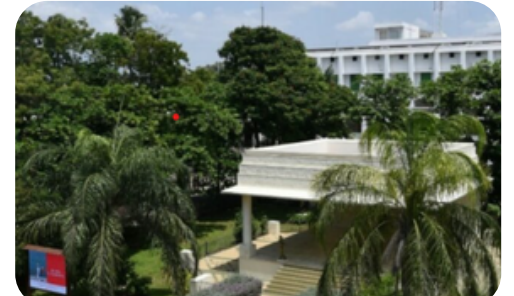
PSGR Women's College