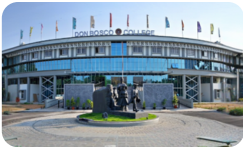
Don Bosco College