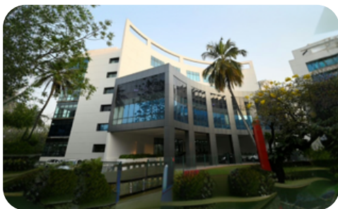
S Vyasa University