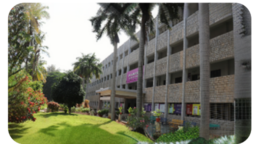
SNR Sons College